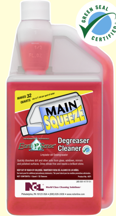
#4171-49 6-32 oz / case