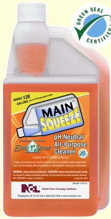
#4172-49 6-32 oz / case

An outstanding cleaner degreaser made with no phosphates, or nonylphenol ethoxylate surfactants. Readily biodegradable with no VOC's, no added fragrance, no silicates, no chelating agents or caustics. Synergistic surfactant system provides enhanced cleaning and degreasing performance. Ideal for general purpose cleaning and degreasing in kitchens, food service, office buildings, light industrial facilities and other areas where environmental responsibility and worker safety issues are important.