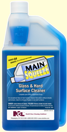
#4170-49 6-32 oz / case

Requires less storage space than ready-to-use products.