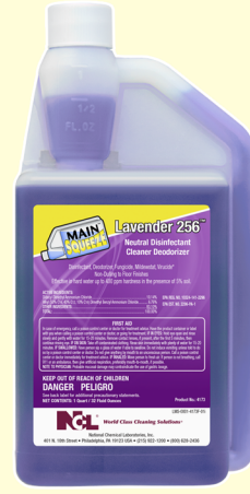
#4173-49 6-32 oz / case

A high performance pH neutral cleaner that is environmentally responsible made with no phosphates, or nonylphenol ethoxylate surfactants. Readily biodegradable with no VOC's, no added fragrance, no silicates, no chelating agents or caustics. Can be used on vinyl, VCT, asphalt tile, as well as terrazzo and other resilient and non-resilient surfaces. Utilizes linear alcohol sulfonate surfactants that provide comparative performance as traditional surfactant systems, but with far less environmental impact. Use Earth Sense pH Neutral Cleaner for: Finished floors, ceramic tile, marble, granite and other natural stone, linoleum, desks, walls, counters, painted surfaces.